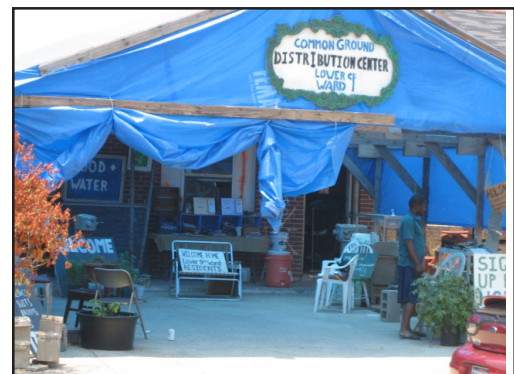
The "Blue House", the organizing point for Common Ground in the Lower 9th Ward. They provide a variety of services including Internet Access. They need volunteers.

This is a very different situation from the 9th ward – that latter was single-family homes with a high level of home ownership. This area that we had crossed into was clearly the world of rentals. At most complexes there was no obvious restoration activity going on. We drove past these rather uninspiring housing units for miles. Although the 9th ward is more symbolic and more devastated, the number of people displaced from this area must be huge. Huge also because I would assume that this area would house the young and employed; white collar workers that populated the banks and businesses of the busy port city that is New Orleans.