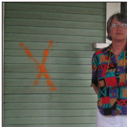
Me, by the X on my friend's home. A lucky one.