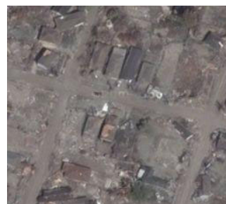
A post-Katrina image.